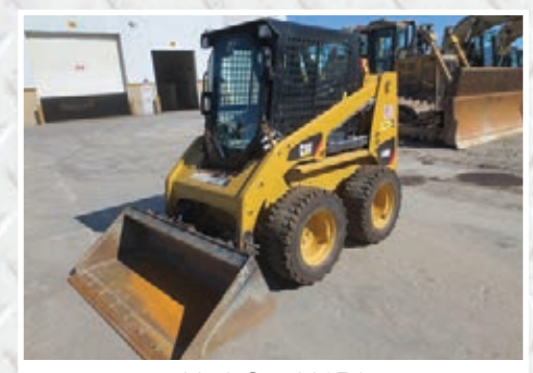
2013 Cat 226B3