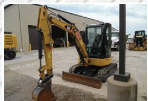
2013 Cat 303.5E CR