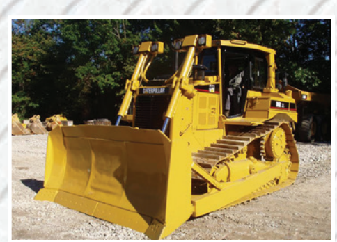
2004 Cat D6R XL