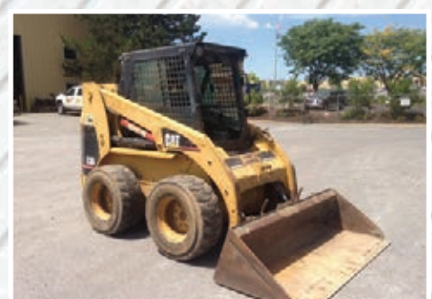
2001 Cat 236