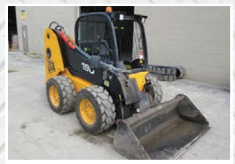
2009 JCB 190 Hi-Flow