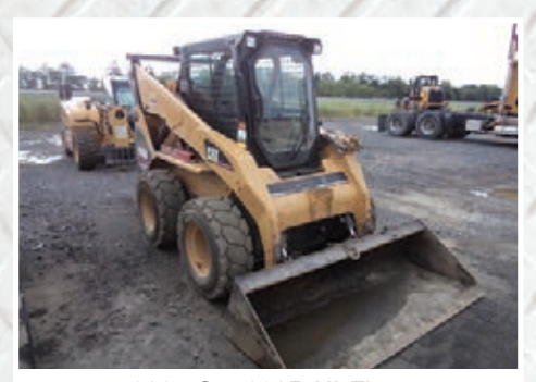
2005 Cat 268B Hi-Flow