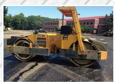
1993 Hypac 766C (1 of 2)