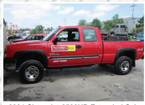
2004 Chevrolet 2500HD Extended Cab