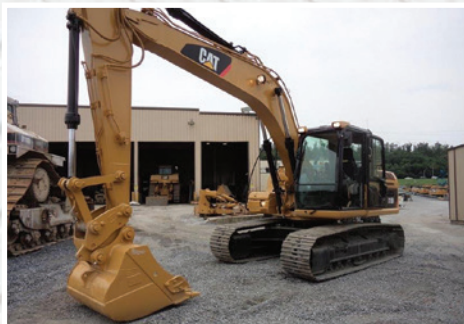
2008 Cat 315DL