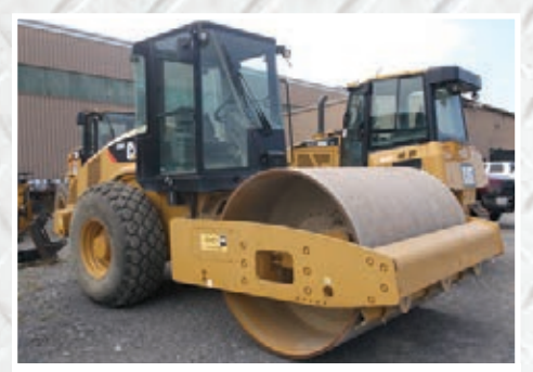
2011 Cat CS56K