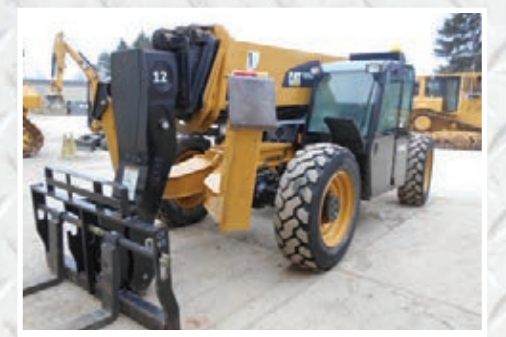
2013 Cat TL1255C (1 of 4)

2012 Chevrolet Express G1500* 2011 Chevrolet Express G1500*