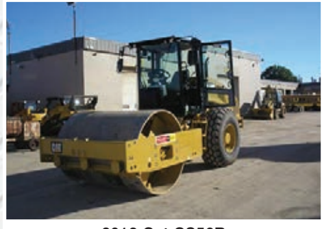
2013 Cat CS56B