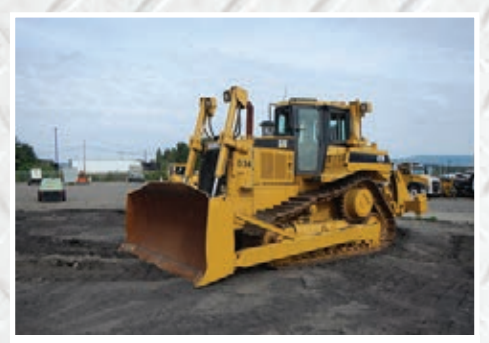
2005 Cat D7R II