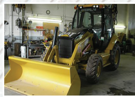
2011 Cat 416E (1 of 2)