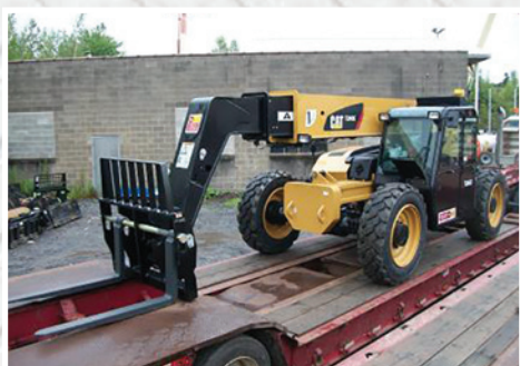
2013 Cat TL943C (1 of 2)