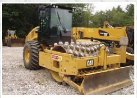
2013 Cat CP56B

2011 Toro TX427 (3) 2007 ASV SR80 2001 Cat 277