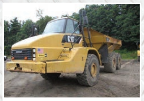
2008 Cat 735 (1 of 2)

2001 Grove TMS760E Hydraulic Truck Crane Link-Belt HTC-8650 Hydraulic Truck Crane