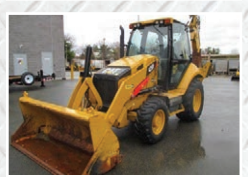
2012 Cat 420F ST