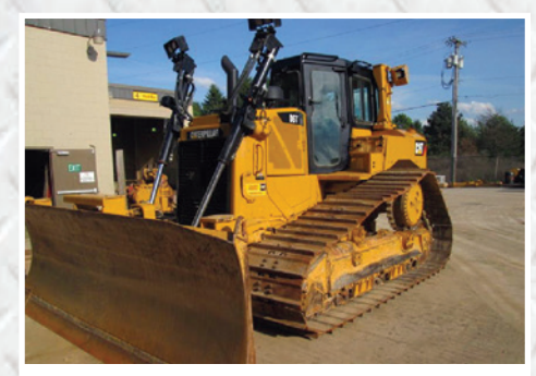
2013 Cat D6T LGP VP